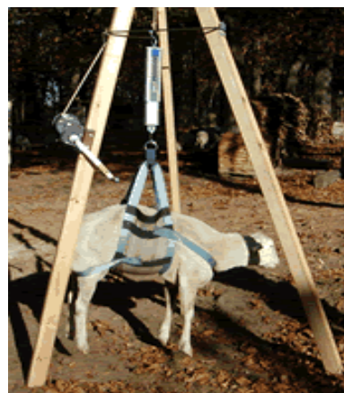
a. balance hanging from a tree